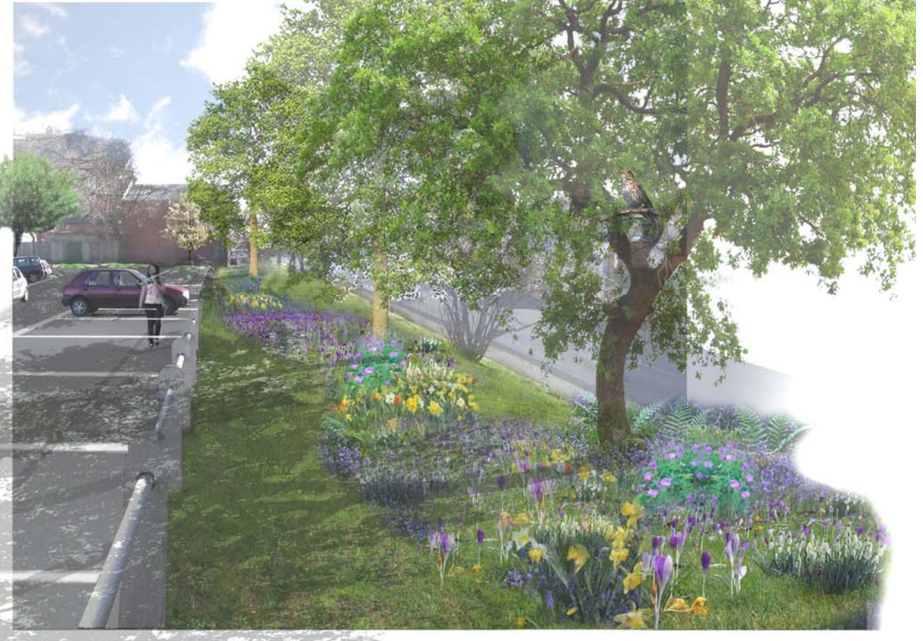
View of proposed new tree line along Chalk's Road