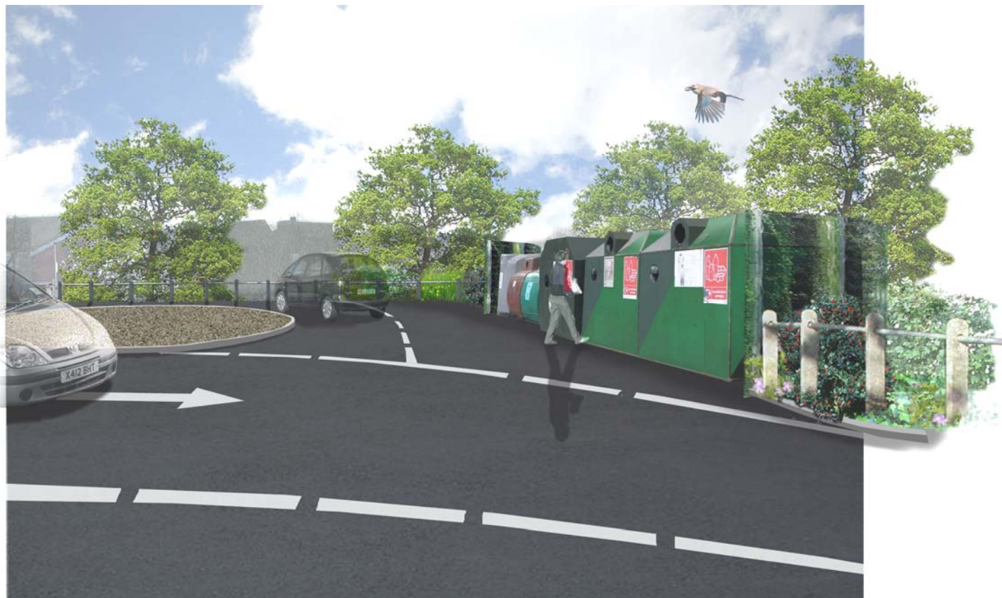
View of proposed new location of recycling bins