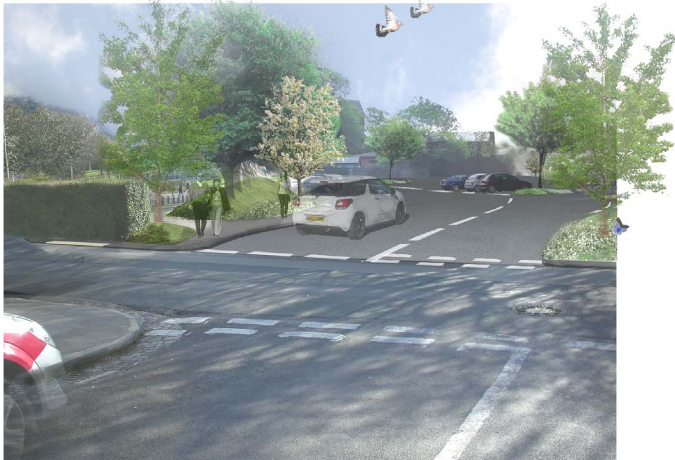
View of proposed new access off Lyndale Road