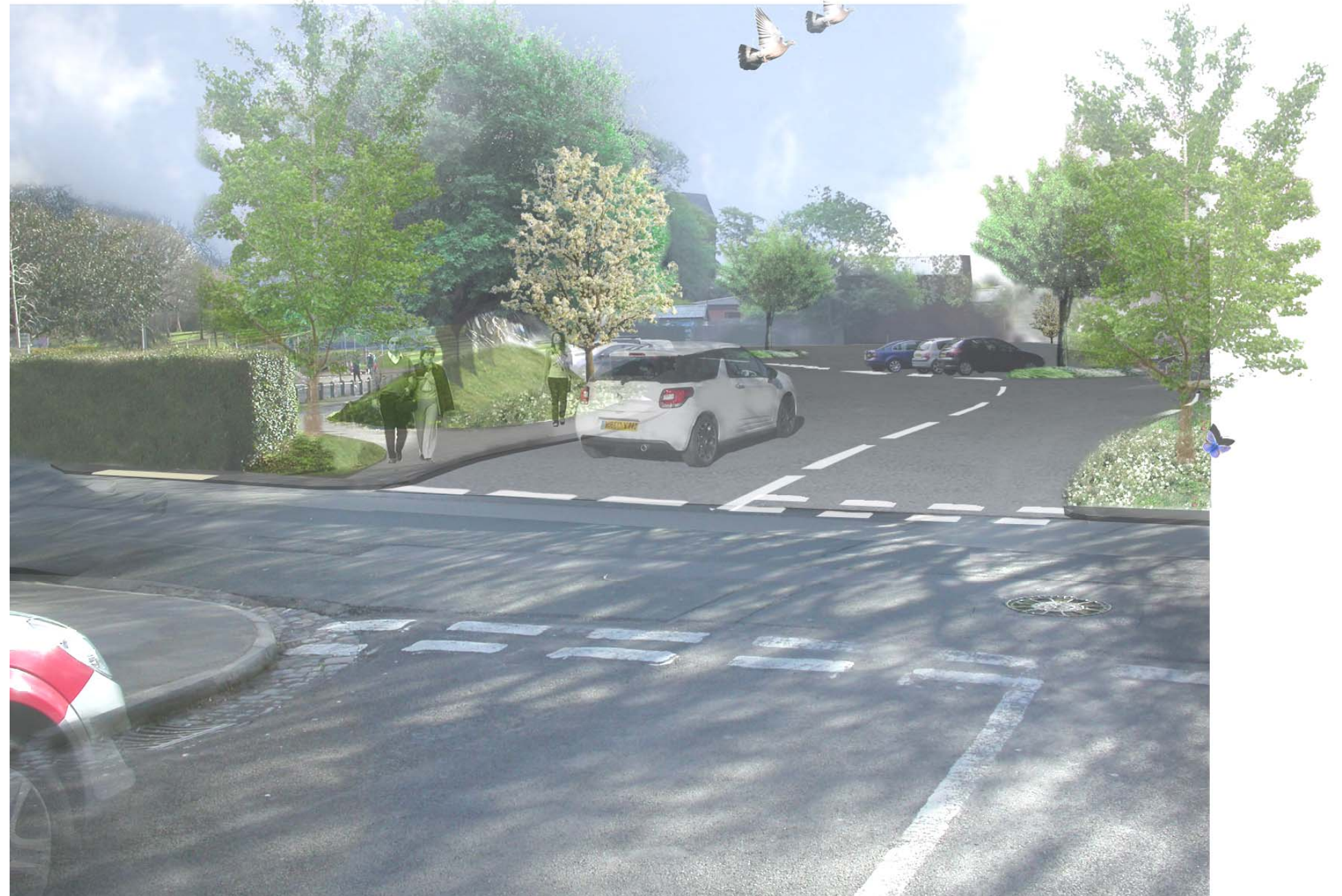
View of proposed new access off Lyndale Road