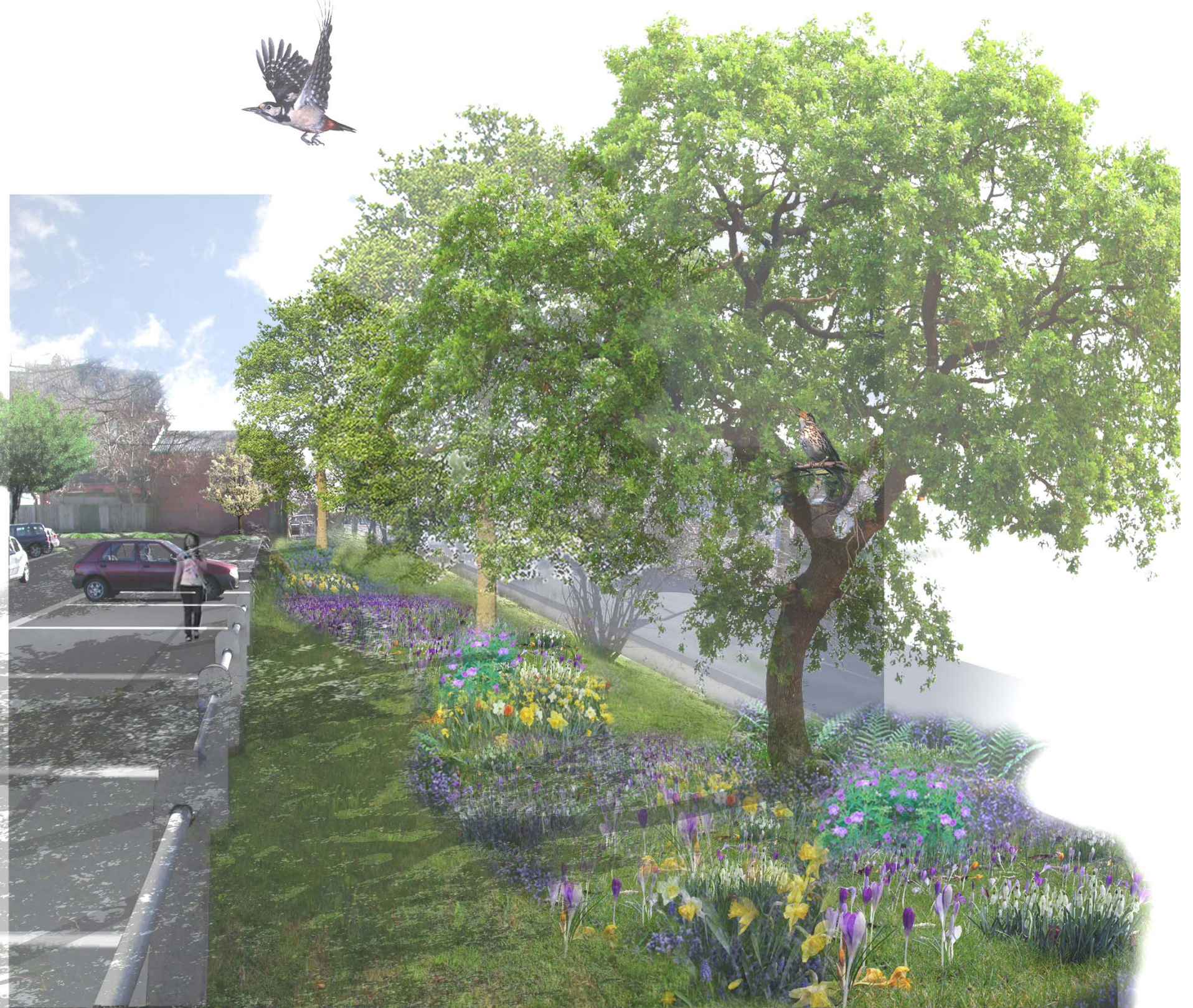
View of proposed new tree line along Chalk's Road